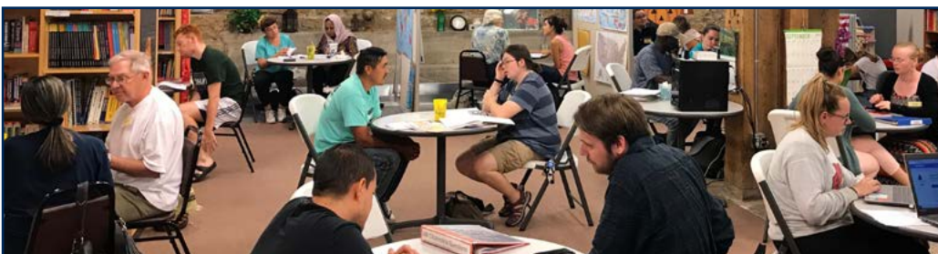
One of many full sessions at the Lantern Center - many tutoring pairs working hard!